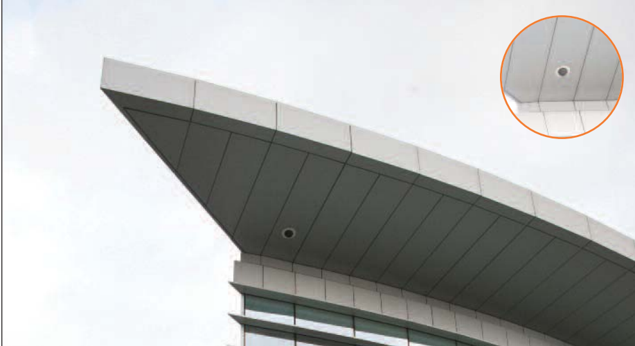
Panasonic i-Pro cameras were selected for the DHL project because of their high performance imaging capabilities and superior low-light performance attributes.

room video wall consists of eight monitors with two monitors split into quad screens, all controlled from a single Workstation PC using OnSSI's NetSwitcher touch-screen, dynamic map-based interface. This configuration provides a total of 14 simultaneous streams,