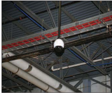
Over 200 Panasonic i-Pro IP cameras have been deployed at DHL's air hub in Wilmington, Ohio; many of which are programmed using the OnSSI solution to be activated using motion analytics.

network cameras, network switches and servers operating on OnSSI's platform. As the