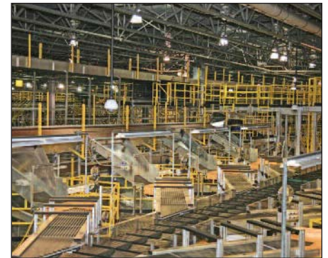
In addition to providing core security surveillance, many of the Panasonic i-Pro cameras located through the DHL facility are employed for process automation surveillance applications to monitor package shipping and sorting operations using OnSSI's advanced IP management and control solution.

The OnSSI IP video surveillance control and recording solution runs on a shared network at the facility that is carefully fire-walled from all other applications. A separate second network is also employed at the facility just for operations surrounding package handling and routing. DHL's video surveillance system