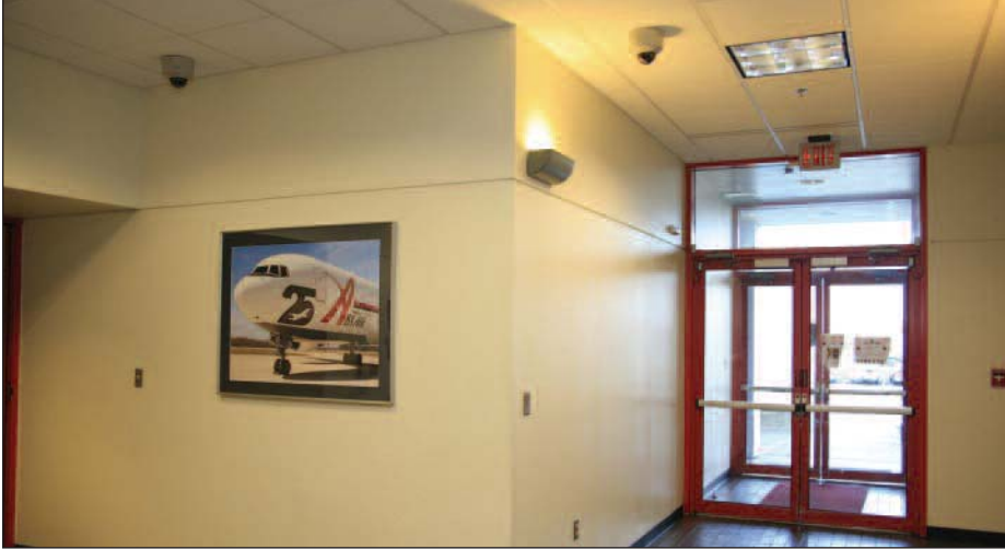
One of the main camera surveillance priorities at DHL is the perimeter of the facility and the ability to monitor vehicles and people entering and leaving the facility.