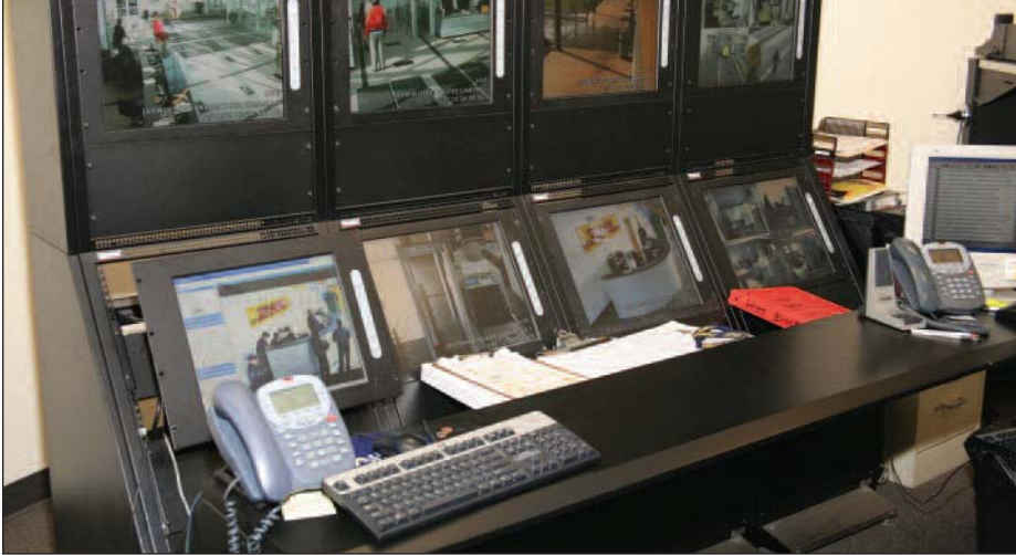
DHL's state of the art control room video wall consists of eight monitors with two monitors split into quad screens, all controlled from a single Workstation PC using OnSSI's NetSwitcher touch-screen, dynamic map-based interface.