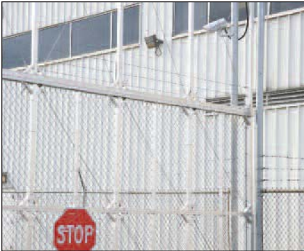
Over 95 Panasonic i-Pro IP cameras installed at DHL are allocated for perimeter security and are monitored 24/7 from a centralized control center using OnSSI’s IP management and control solution.